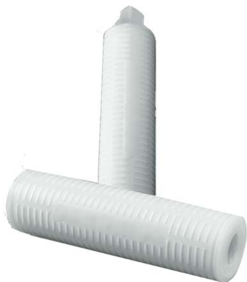
Figure 1: Memtrex PM (MPM) Pleated Filters