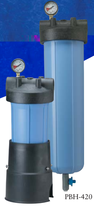
PBH-410 (shown with bag vessel stand)